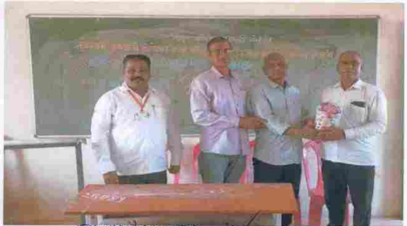
अनुमोदक प्राचार्य (उजव्या)