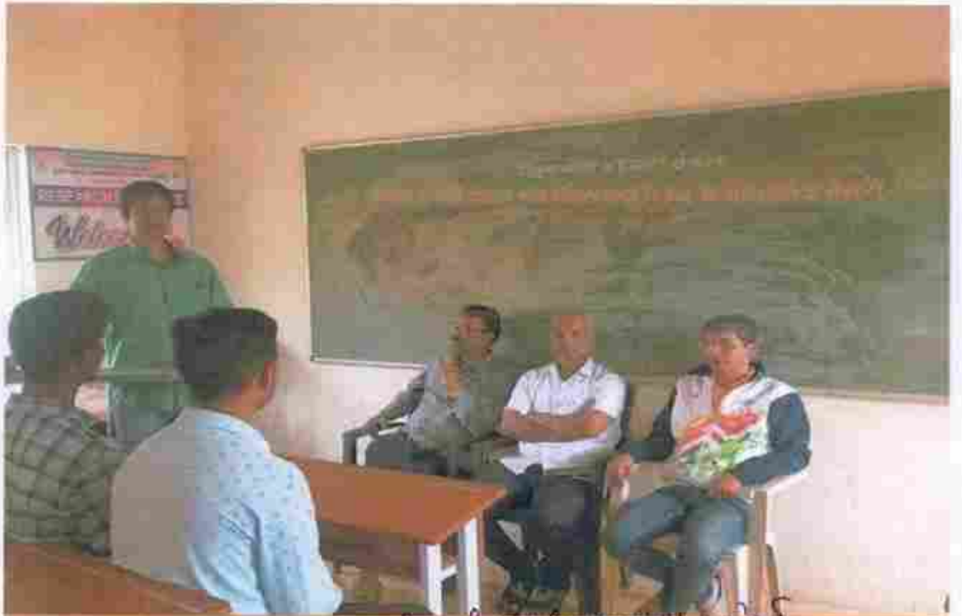
महामाजी मंडळी महाराजी २१.९.१९ रोजी.