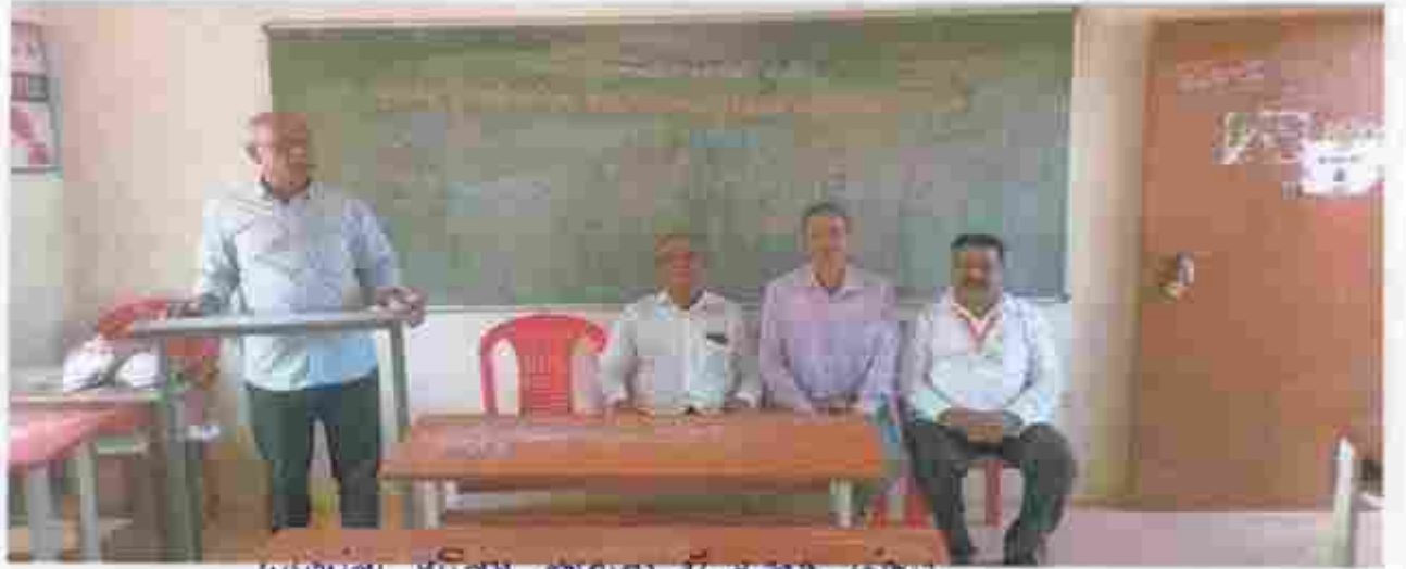
प्राधान्याचा प्रश्नाने उत्तराचा उत्तर देताना